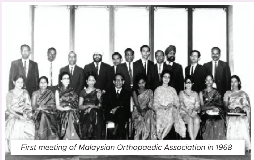
First meeting of Malaysian Orthopaedic Association in 1968