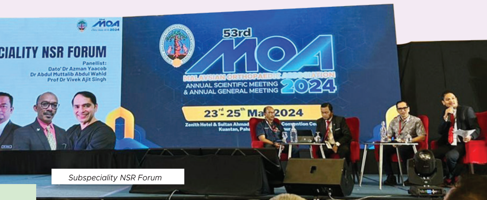
Subspecialty NSR Forum