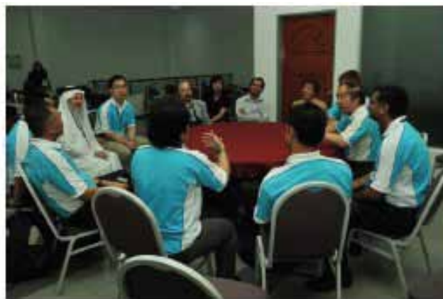
Post mortum session after end of the course

We managed to have a short post-mortem session with all foreign faculties, organizing committee and Synthes staff. The local chairman will organize the feedback (on general organization of the course and individual lectures) and send a copy together with the account statement to all parties involved. Hopefully these materials will be helpful for future training courses in the country.