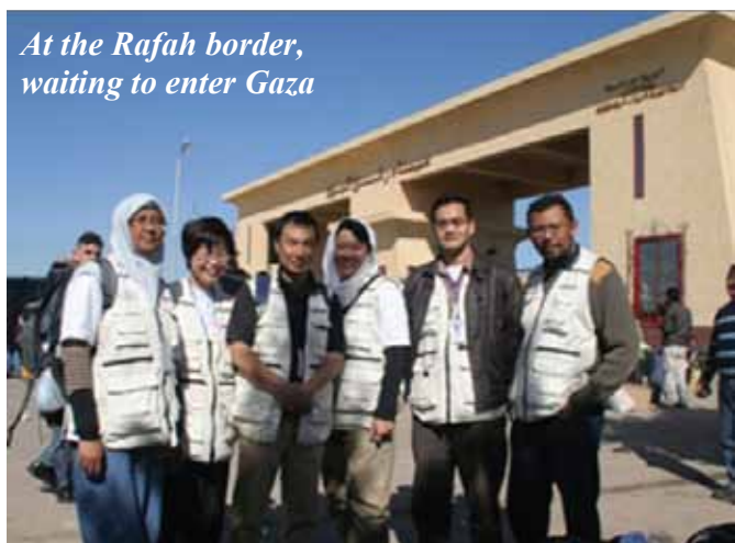
At the Rafah border, waiting to enter Gaza