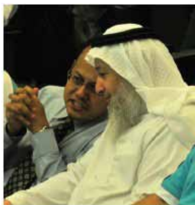
Academic discussion between two heads of medical faculty

All the regional and international faculties were present during the pre course session that was held one day before the actual course. We went through the teaching materials and checked the instruments. Since this is the first time we were holding this course, the organizing committee was expanded to include senior ORP members to maximize their exposure to the new procedures. For the group discussion, the organizing committee requested for it to be organized in small groups so that more participants can be more directly involved. The local faculties reviewed the material for the following day and ground rules were set on how to conduct the discussions effectively.