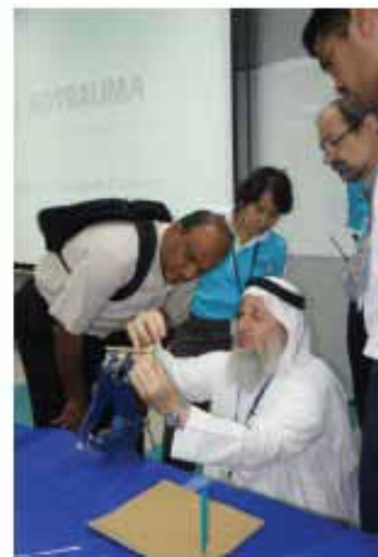
This is how it is done